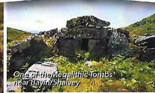
One of the Megalithic Tombs near Bavin/Shalvey

DISCLAIMER: Information included in this publication is provided in good faith and believed to be correct, however Sliabh Liag Hillwalkers cannot accept any liability for errors or omissions. Please note that Sliabh Liag Hillwalkers cannot be held responsible for any loss, injury or damage caused on a club walk or weekend or on the journey to and from each walking venue, however caused. Members should note that hillwalking can be a dangerous pastime and that the club has no control over the condition of the terrain to be walked or weather conditions. Each club member voluntarily assumes the risk of taking to the hills and should therefore familiarise themselves with navigation and walking techniques suitable for the standard of walk taken chosen and be suitably equipped to ensure his or her own safety in the hills at all times.