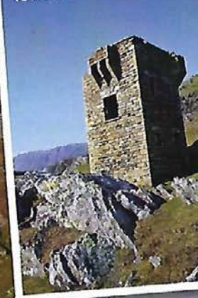
Tower at Glen Head